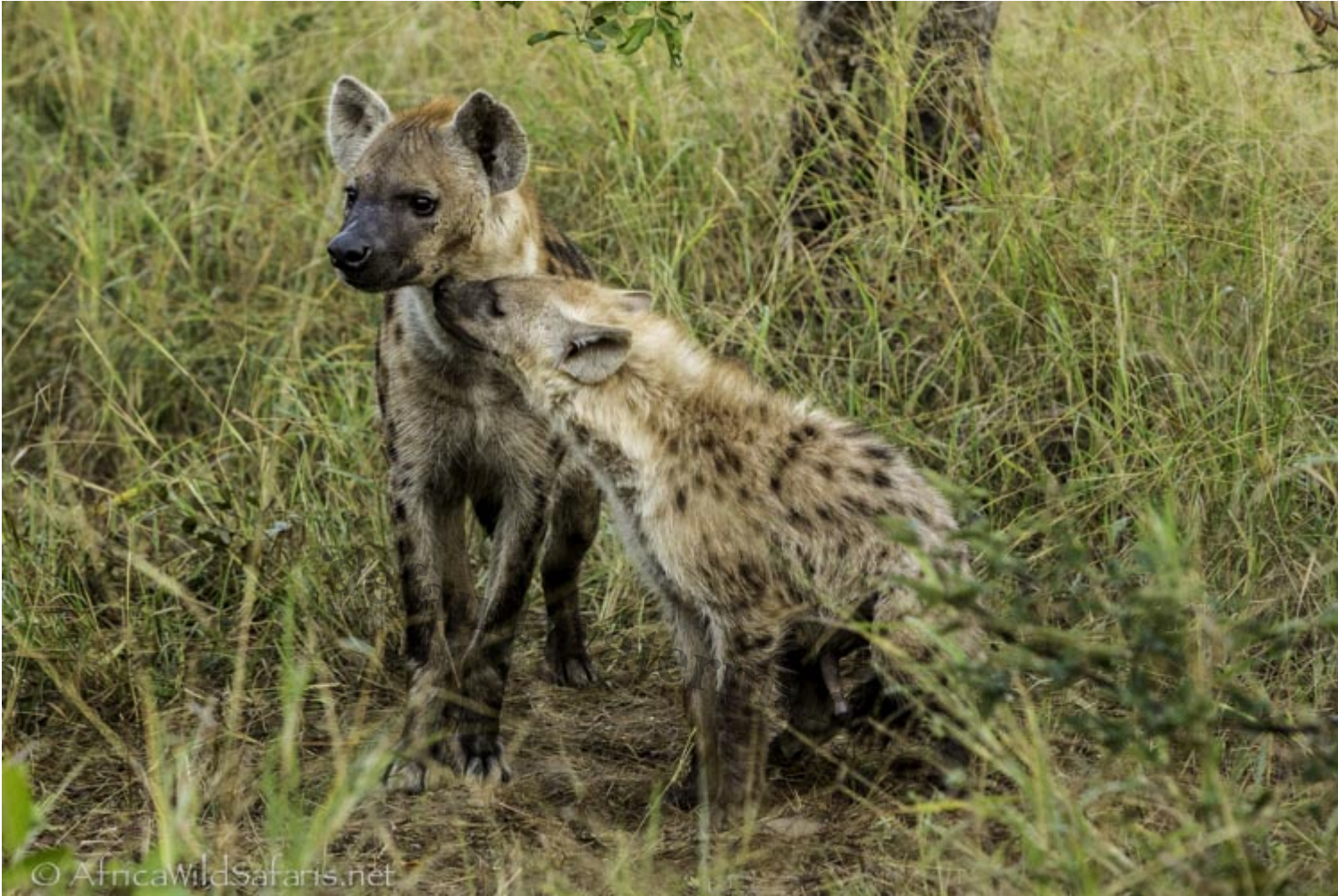
The Oldest pup greets the babysitter