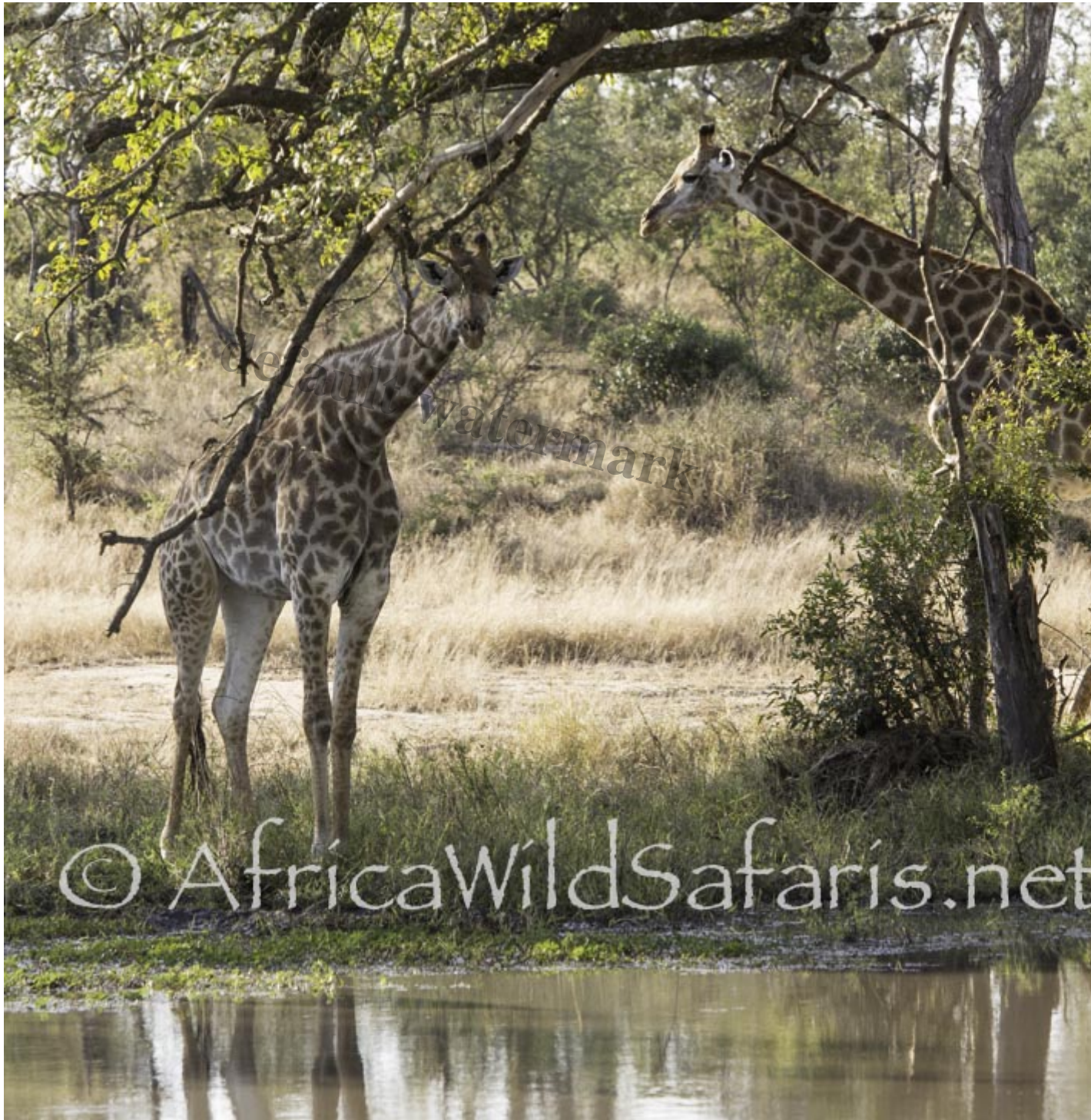
Mother and young giraffe come to drink

We just spent a spectacular 2 days in Sabi and another in the big cat reserve. There seemed to be young animals every where: baby giraffes, zebras, and elephants.