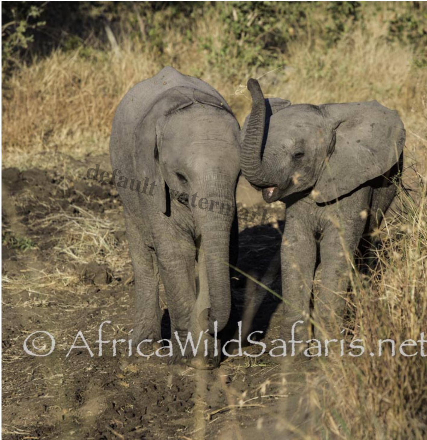
Two baby elephants

Our first evening we were treated to lion cubs and the whole pride. They played while walking with their father, nursed from their mother, and did some exploring.