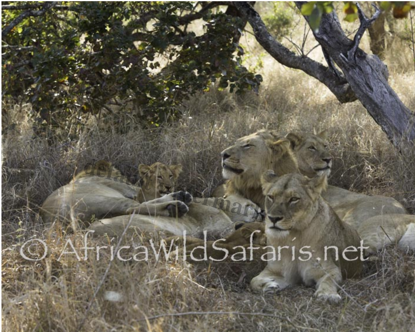
Lion pride mosh pit with the whole family together

A cub walks with a juvenile male, probably a brother