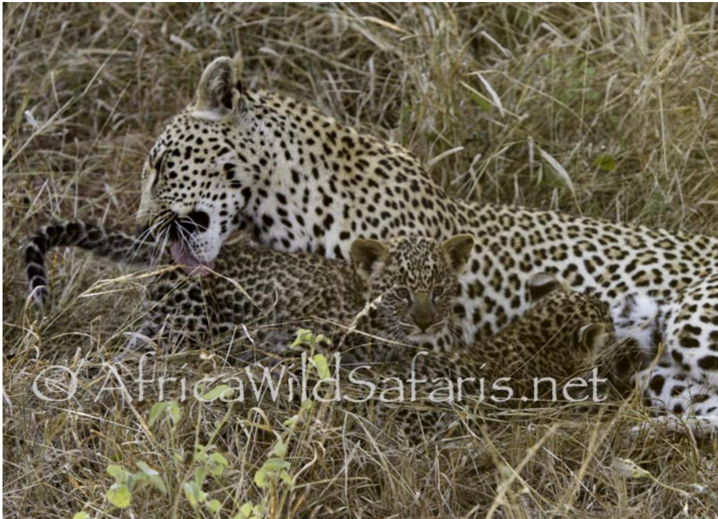
Mom leopard nursing her two cubs