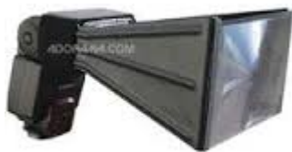
Better Beamer Flash Flash Extender

Sometimes the simplest and least expensive products work the best. Case in point is The Better Beamer ( Better Beamer at B&H ) . Itâ€™s a flash extender that attaches to the strobe and concentrates and magnifies the light into a tight beam. This gives your strobe the ability to reach out to your subjects when using a long lens. If the subject is at a distance which requires a telephoto lens, the light from a small strobe could be pretty diffuse by the time it gets there having little or no fill flash effect, but the Better Beamerâ€™s light concentrating ability helps with the distance problem. The Beamer breaks down very flat for traveling and was pretty quick to assemble. I am thoroughly happy with this small purchase as it enhanced my photos, packs small and light, and can light a hippo at dusk from a distance of 15m. I was surprised at how the animals seemed to be unfazed by the flash; if it caused an elephant to charge, I wouldnâ€™t be here to give a review. Because I am so happy with this simple devise, I recommend that if you bring a strobe on your wildlife shoots, also pop the Better Beamer in your gear bag.