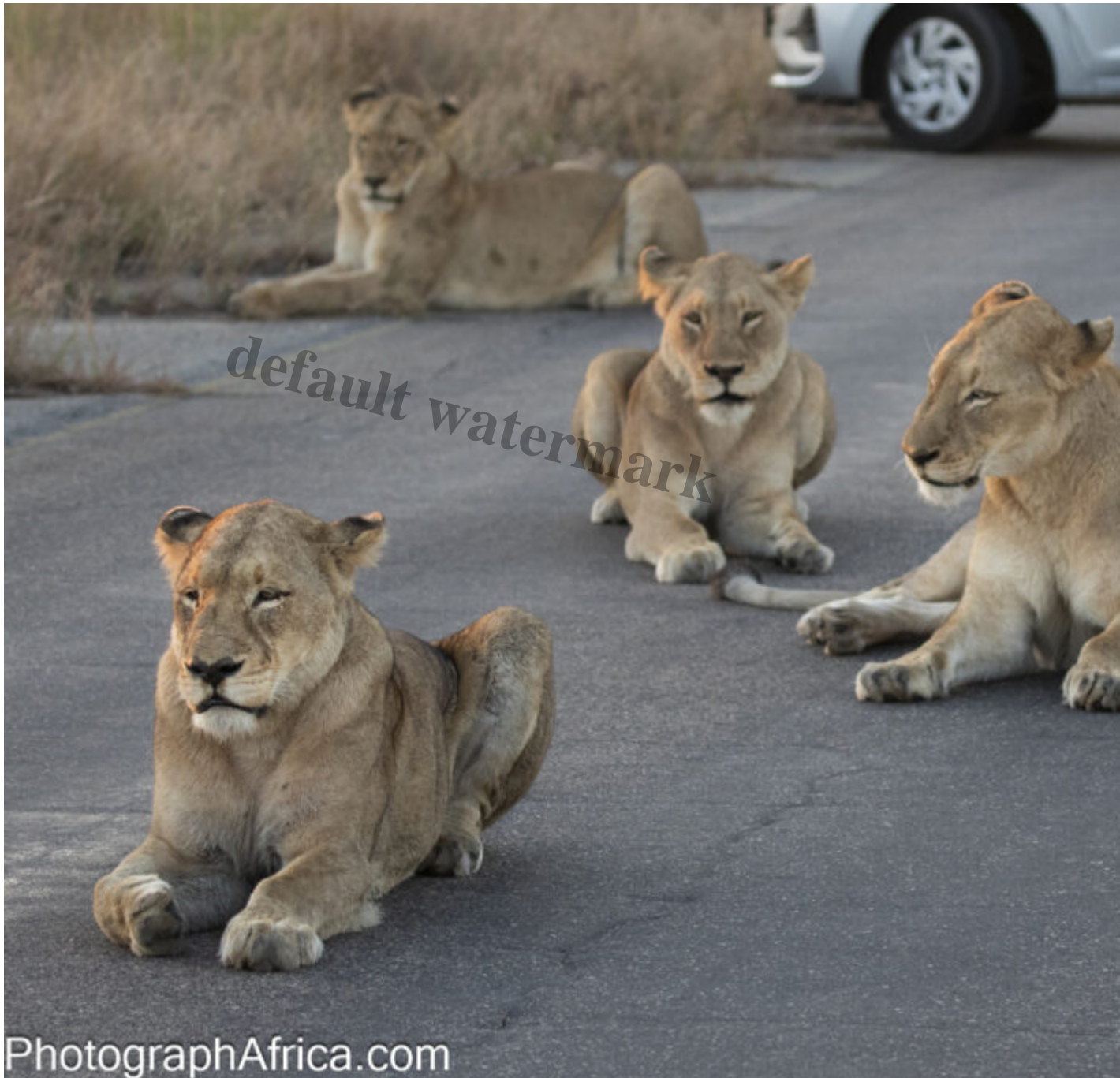
Lions block the road our first morning in Kruger

I have selected highlights to describe but as always the best way communicate how incredible each safari is through the images. The most special encounter was on our last morning when 7 lions , 3 females and 4 cubs, came to our hide to drink. When their eyes looked towards us in the hide it took your breath away. It felt very special and lucky and of course the images and video were stellar.