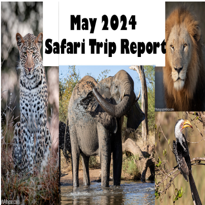
Photo Essay and Highlights from my guided small group safari to the Kruger Region of South Africa May 2024