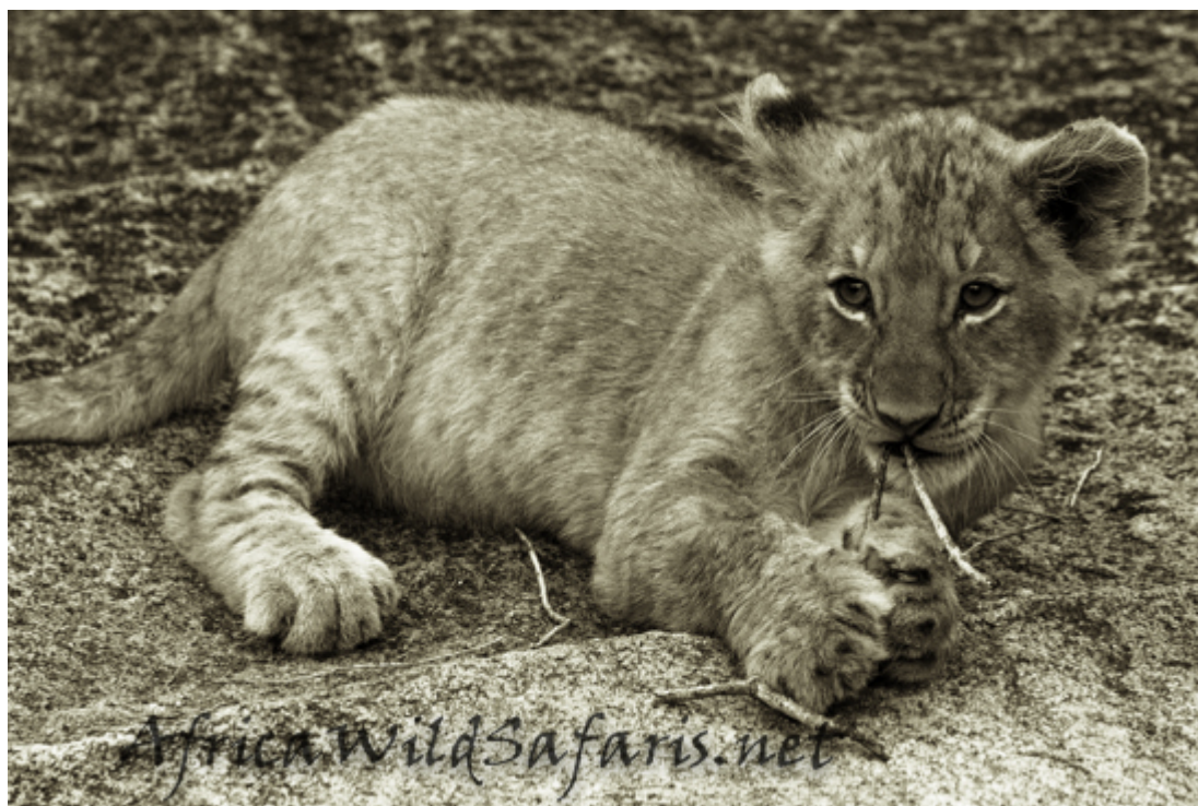
a monochrome version with tinting from the split tone tool

These settings also make a good sepia black and white. To see, leave everything and push down the Saturation Slider in the Basics panel to remove all color leaving only the tones from the Split Tone tool.