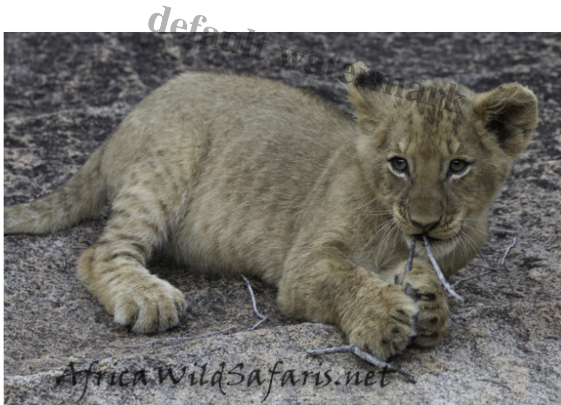
Lion cub image as shot in the late afternoon in on a shady rock

There are many ways in Adobe Lightroom & Camera Raw (not to mention Photoshop) to correct or adjust the color of an image. Here I will show you how a tool you might not have used before can boost or correct color.