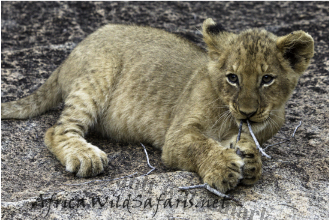
Image after curves adjustment for contrast and a white balance adjustment

This lion cub image has great qualities, but is lackluster in the color.