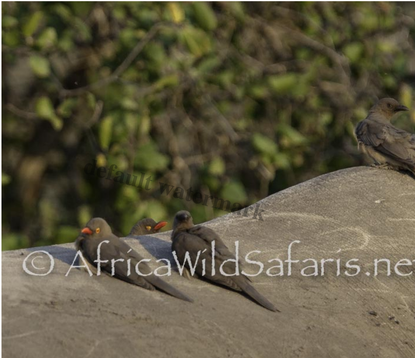
Ox Peckers feel safe and take a break on the back of a rhino