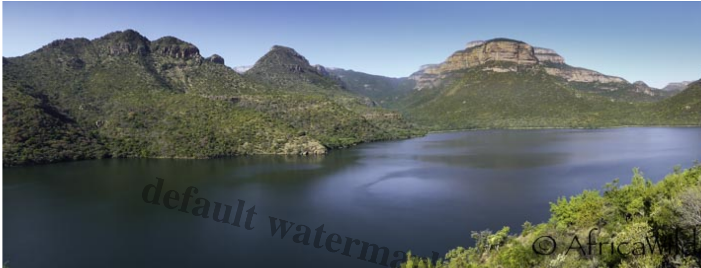
A view of the Blyde River Canyon from the observation platform. The water is home to crocodiles and

I can still be moved by the beauty of landscapes I see daily.