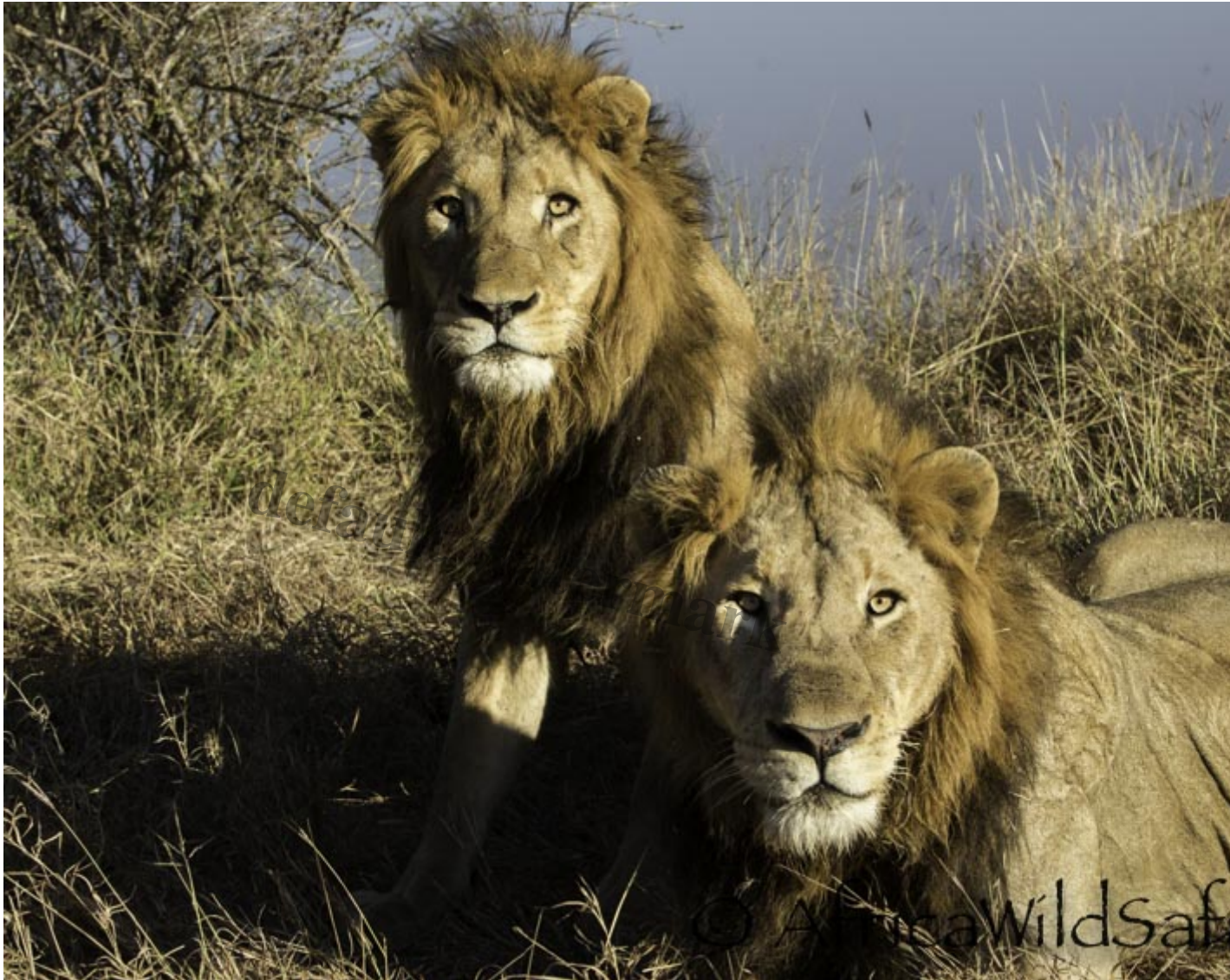
Lion brothers relax with their female pride members