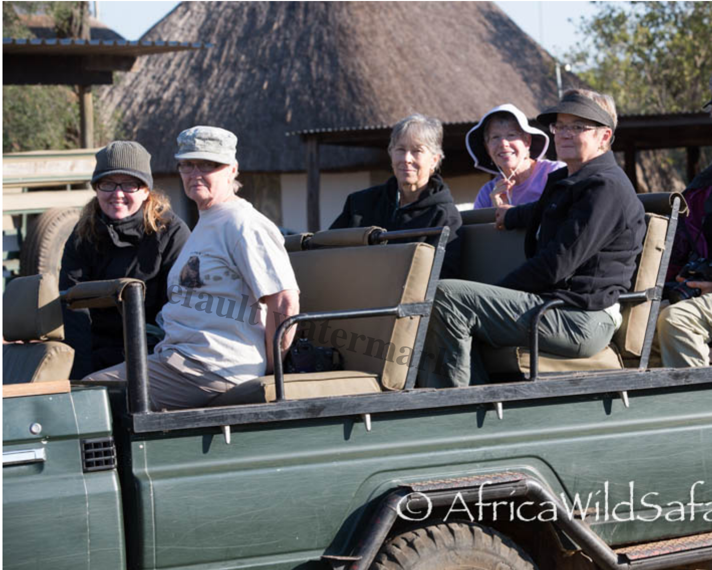
Guests on morning game drive , late September