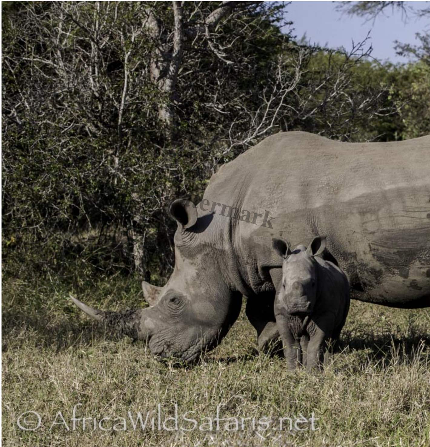
White Rhino: Mother with baby

White Rhino: standing in a defensive position with an ear and nose in each direction.