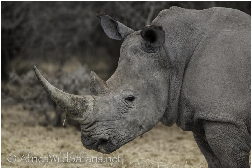
White Rhino: wide mouth and 2 horns